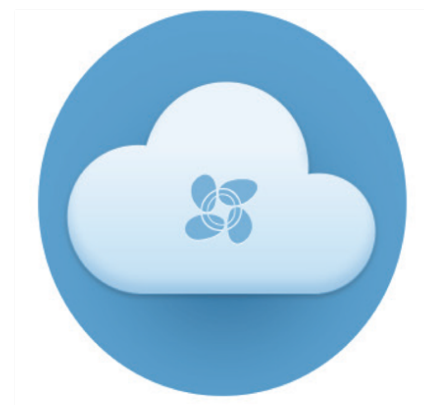
Encrypted Cloud Storage