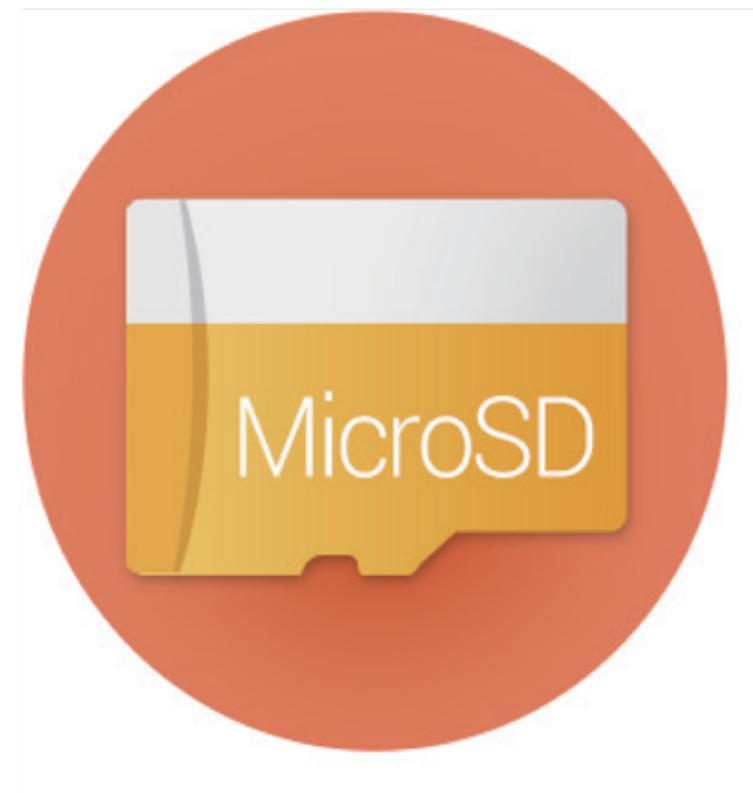
Supports MicroSD Card

Save your recordings with flexible and secured solutions. The DB comes with a built-in MicroSD card slot that can store up to 128 GB of recorded footage.