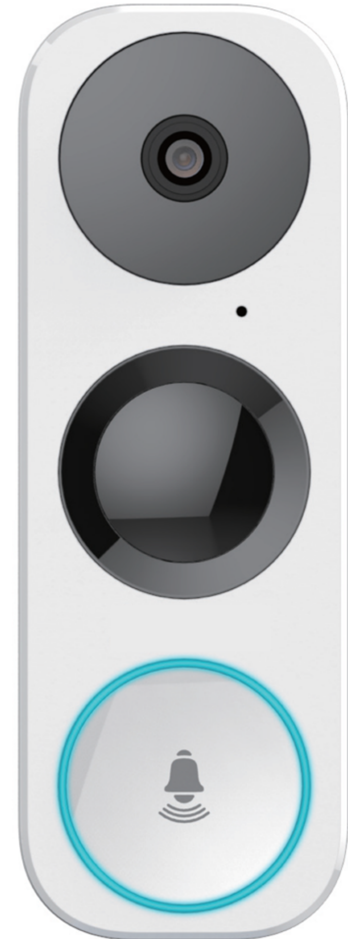
Model : GS-DB313W